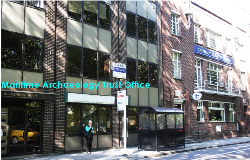
Maritime Archaeology Trust Office